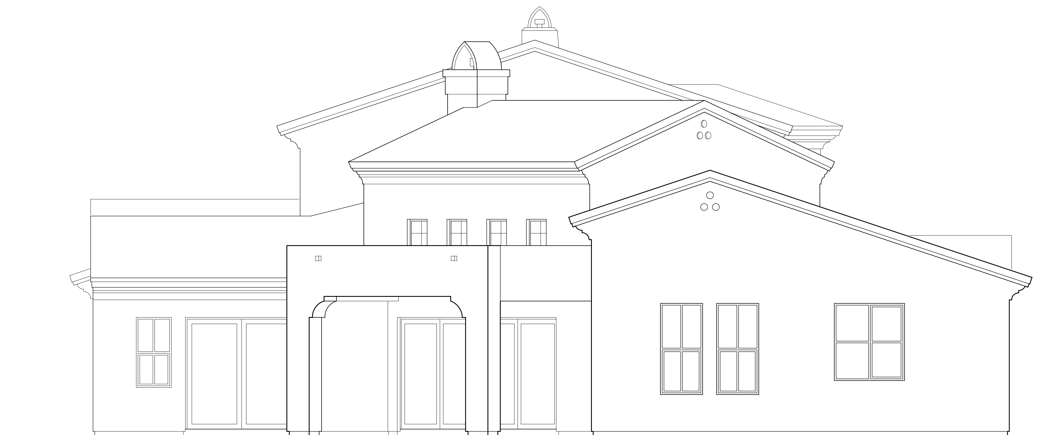
② REAR ELEVATION