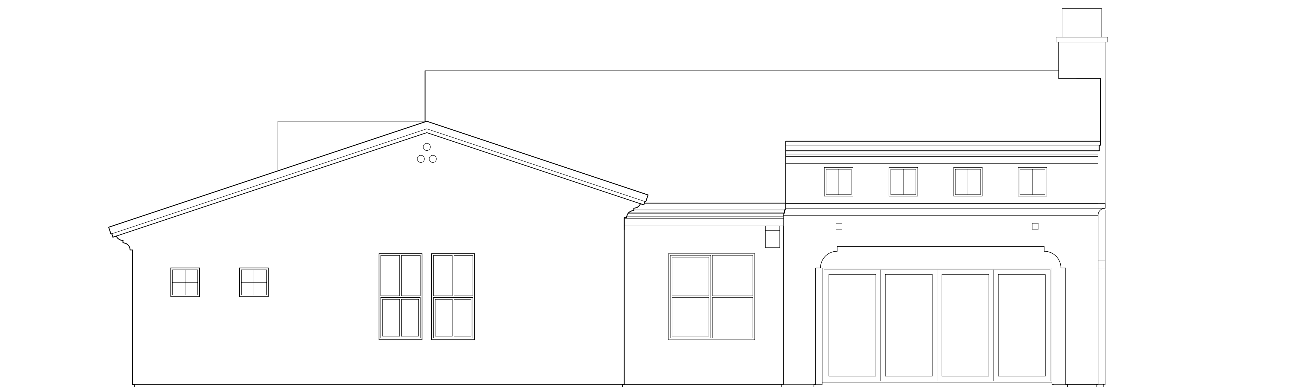
2 REAR ELEVATION